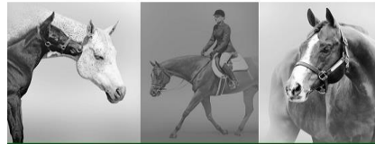
CAPALL CREEK FARM WWW.CAPALLCREEK.COM

check for updates: www.martinganza.com Facebook: Martinganza or NCQHA District IV